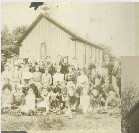
SS#4 MULMUR IN 1905