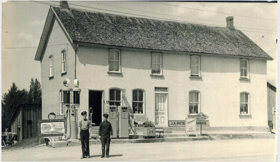
PATTERSON'S WHITE ROSE SERVICE STATION, PRIMROSE, CA. 1940

Driving Directions: Continue north on Prince of Wales Road.