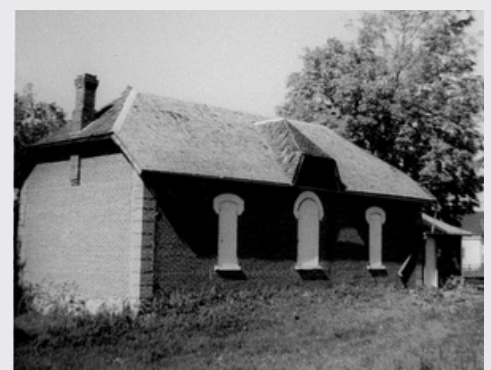
LOYAL ORANGE LODGE IN 1978