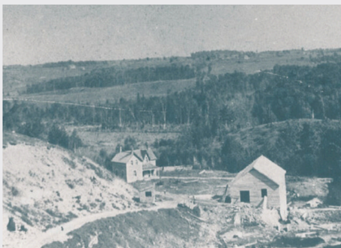
PINE RIVER LIGHT AND POWER, UNDER CONSTRUCTION CA. 1915

There is roadside parking. If you are agile and sure-footed, you can climb down the trail to the dam and large lake. While the lake is no longer stocked with fish, the dam ruins are worth a look. This was the site of the Pine River Light and Power Company from 1908 to 1914. Organized by Thompson R. “T. R.” Huxtable, a miller from nearby Horning's Mills, it was one of the early private electricity generators in Ontario, serving Shelburne and Orangeville. The scheme was bankrupted by competition from Ontario Hydro. There is a terrific view from the dam up the lake.