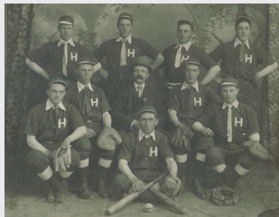
HONEYWOOD BALL TEAM, 1914

The oldest settlement in north Mulmur, it was called the "Yorkshire Settlement" because most of its early inhabitants came from that English county as a group in 1848. The community boasted all the usual service businesses, and in time, included some substantial stores and a bank, as well as churches and a continuation school.