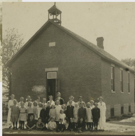
SS#4 MULMUR CA. 1920