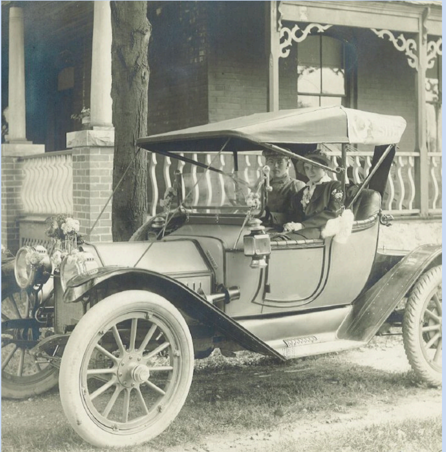
IRA & MURIEL GALLAUGHER ON THEIR WEDDING DAY, MULMUR, 1915 MOD COLLECTION P-1892