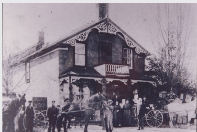
MANSFIELD GENERAL STORE CA. 1900