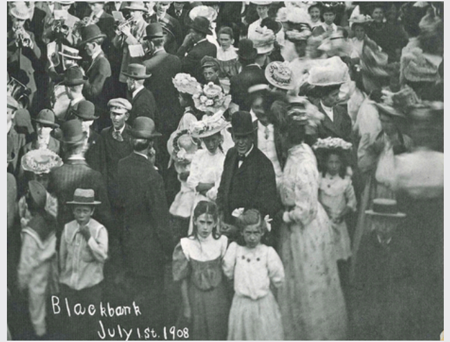
CHURCH SUPPER AT BLACK BANK JULY 1ST, 1908