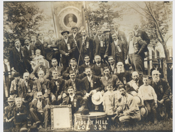
MEMBERS OF LOYAL ORANGE LODGE #354 IN 1909

Another "Mulmur" village that straddles the township boundary with neighboring Mono township. The well known restaurant "Mrs. Mitchell's" occupies the school house of SS # 2, Mulmur. Across the street, "Granny Taught Us How" is located in the former Orange Hall in Mono. The main street of the village is actually the township boundary here, not Highway 89. Stand in front of either building and look along the street, You will quickly see how roads have moved to adapt to the topography.