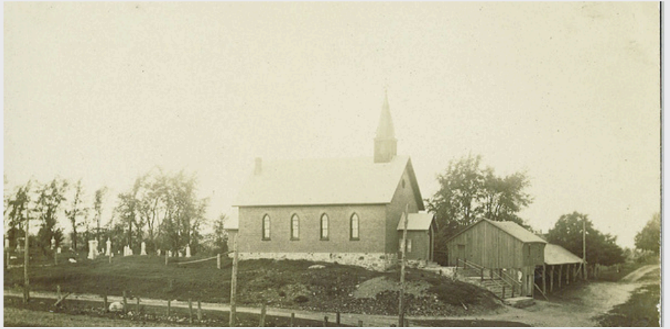
WHITFIELD ANGLICAN CHURCH & CEMETERY CA. 1910

Driving Directions: Continue east along County Rd 17 and pull over at the first field on your right.