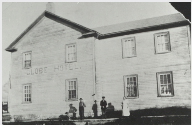
THE GLOBE HOTEL, CA. 1900

Interesting tale about the two hotels in town - McCartee's Hotel's on the north side of the main road and the Globe Hotel on the south side. On night, McCartee's Hotel caught fire and legend tells us that the Globe's owner's wife guarded the well on her property, the only well at the corner, with a shotgun and would not allow the firefighters to use it to save the opposition's building. Good way to eliminate your competition!