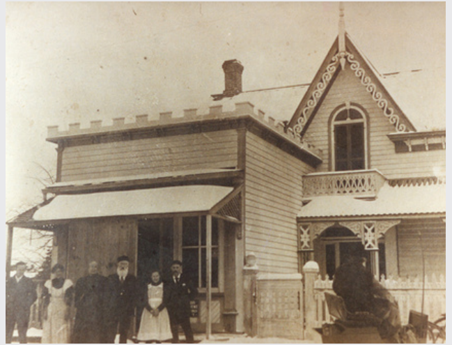
CHURCH SUPPER AT BLACK BANK JULY 1ST, 1908

At the crossroads of Airport Road and 5 sideroad was the village of Stanton. Once a thriving hamlet with a court house, two hotels, a general store, post office and school. On your left once stood Win Hand's hotel, aka the Stanton Hotel. It was built in 1863, and operated as a hotel for about 15 years before it was turned into a wagon shop in the bottom with the family living upstairs. Beatty's Stanton Hotel was on your right and continued in business for more than 40 years. The building was removed in the early 20th century. Across the way, the General Store on the corner and the former post office beside it, built by John A. Love, are now both private residences.