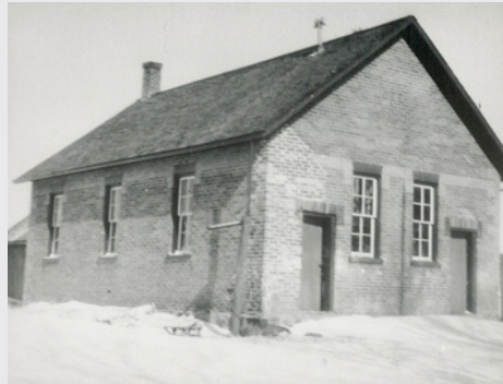
SS# 21, LOWER PERM SCHOOL, IN 1946

Driving Directions: Continue west and down the hill, turn left (south) on the Fourth Line. You will cross the Boyne River and continue south to the first intersection. Turn left (east) on Five Sideroad. Turn right on 5th Line and continue to the stop sign. At the intersection turn right onto Highway 89, heading west, and proceed about 4 km to Violet Hill. Make a right at Mono-Mulmur Townline.