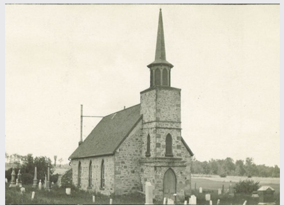
ST. LUKE'S ANGLICAN CHURCH & CEMETERY, CA. 1920