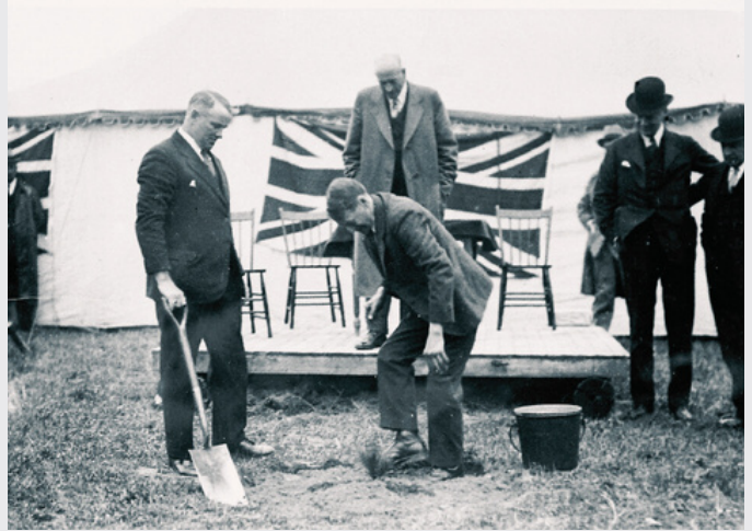
FIRST TREE BEING PLANTED IN THE DUFFERIN COUNTY FOREST, MULMUR ON MAY 8, 1931

The camp kept moving north following the cutting line and settled finally here. Once the pines were gone, wind and water erosion started their work. By 1931, the County of Dufferin was buying abandoned land at tax sales and planting the tracts of the Dufferin County forest.