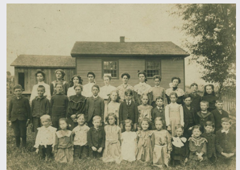
SS#6 MULMUR (BANDA), CA. 1900