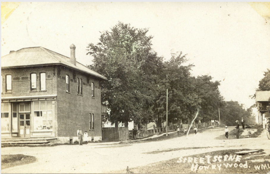
HONEYWOOD, 1909 WITH GENERAL STORE ON THE LEFT