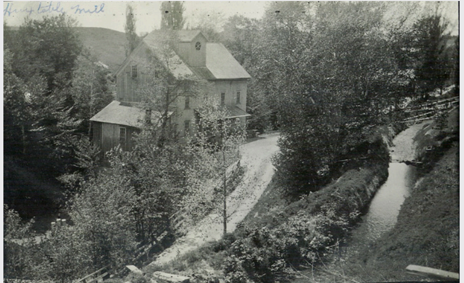
HUXTABLE'S MILL, A FLOUR AND GRIST MILL ON RIVER ROAD AT THE EAST END OF HORNING'S MILLS, CA. 1890

Continue to the stop sign and welcome to the Village of Horning's Mills. Turn right at the stop sign and again when you reach 15 sideroad. Continue east along 15 sideroad (road will change to gravel), and then back into Mulmur township. After about 3 kms, the road swings to the left – so will you! You are now on 2nd Line.