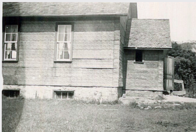
SS#15 MULMUR (KILGORIE), CA 1940