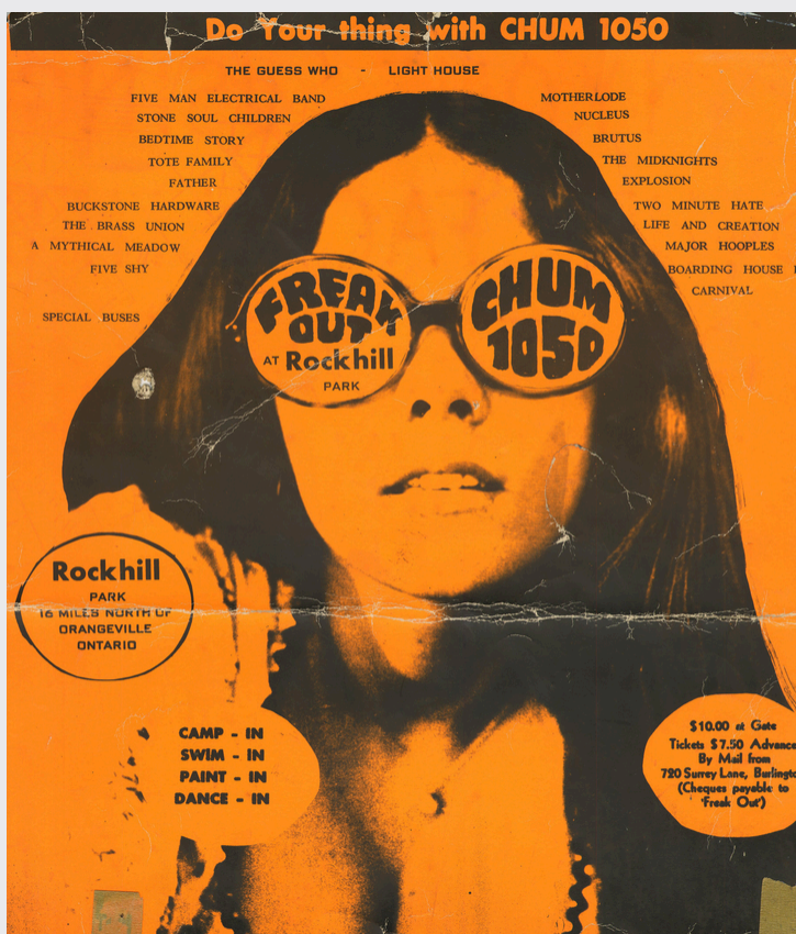
POSTER FOR ROCK HILL PARK'S "FREAK OUT FESTIVAL" IN 1969

Driving Directions: Continue east along County Rd 17. After the horseshoe curve you will turn left onto 2 nd Line. Continue north.