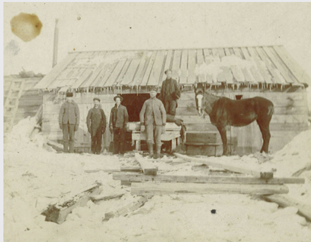
SCRIVER'S SAWMILL, TERRA NOVA, CA. 1905