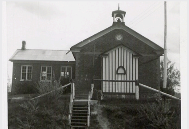
SS#1 MULMUR (STANTON), 1952

Stanton school (SS#1) is on your right on the knoll. This was the first school section in the township. Ahead on the left is the former Creary farm. The stone farmhouse once served as a bastion to protect the women and children of the community. In 1866, rumours were flying that the Fenians were coming – an Irish American army of invaders who were going to capture Canada and hold to ransom for Irish independence. The fiery Orange men of Mulmur deposited their families here, and adjourned to Rosemont to await the Fenians in the three hotels in the village, certain sure the Irish Catholics of nearby Adjala would rise in support of the Fenian brotherhood. The longer they stayed in the hotels, the more dire the threat became. In the middle of the night, the local doctor trotted his horse into the village, returning from a maternity call. He told them to go home, the people in Adjala were all sound asleep in their beds unaware of the near riot in Rosemont. Saner heads prevailed, and the “militia” dispersed.