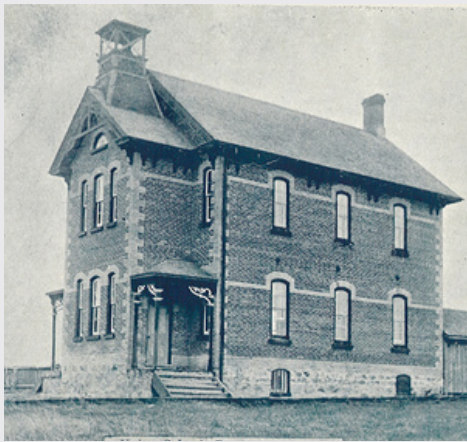
USS#17 MONO (ROSEMONT), 1910

This is the end of your tour of Mulmur Township. Turn right on Hwy #89 and then a right at the lights at Airport Rd. to return to the Museum of Dufferin. Stop in for a visit and explore the everchanging exhibits and explore more of Dufferin County's history in the Archives!