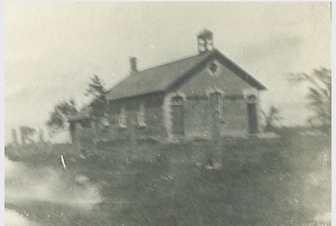
SS#7 MULMUR (RUSKVIEW)

This corner was originally "Black Bank" until the post office moved west to the mill community about 1875. In 1883 a new post office opened up here named "Ruskview"; named for the Rusk family who farmed here, and the view. The building on the southwest corner was built in 1880 and housed a blacksmith, a store and a family home. There was also a school and an Orange hall. As the Mulmur historian says: "Thus was the corner built up and torn down, and the family after which it received its name all gone. Still the view remains, the grandeur unsurpassed."